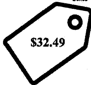
Kleenex Tissues with Lotion - 18 Boxes