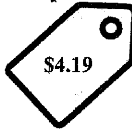
Heavy Duty Paper Plates - 10" - 50 Count - up & up™