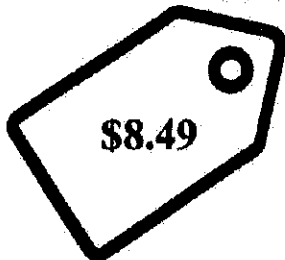
Puffs Plus Lotion Facial Tissues 6 Pack